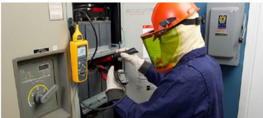
Using the Fluke BT52X to measure impedance, for the quarterly cell/unit internal ohmic value test.

In addition, before conducting the test, prepare a cooling system to compensate for a rise in ambient temperature. When large batteries discharge, they release a significant amount of energy expended as heat.