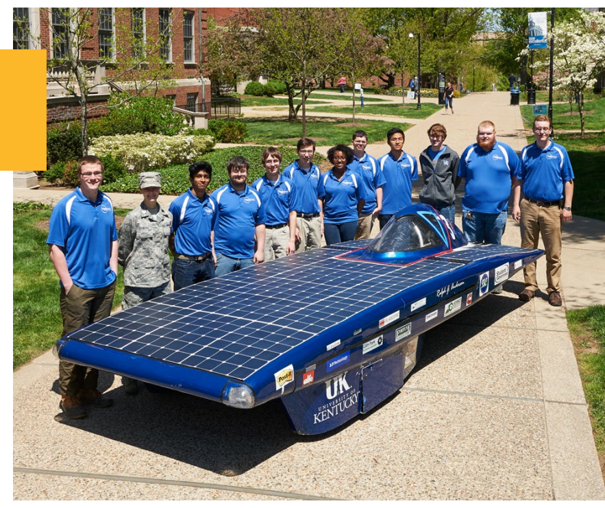
Engineering students at the University of Kentucky win the inaugural Fluke Connect<sup>®</sup> Student Contest with their solar car optimization project.

"Our team encompasses all the fields of engineering at UK-chemical, civil, electrical, and mechanical, and all work in a different capacity," he said. "We also have business majors, media majors and fine arts majors on the team."