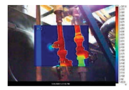
Thermal imagers can show many sources of waste - here highlighting heat loss from non-insulated pipes.

Steam traps can be blocked by dirt in the system, and corroded because of the condensate. If a steam trap fails open it blows live steam, wasting energy and money. If it fails closed, condensate accumulates in the heat transfer equipment and pipelines. That may affect the processing characteristics, and in severe cases can lead to water hammer and mechanical damage to the equipment/pipeline.