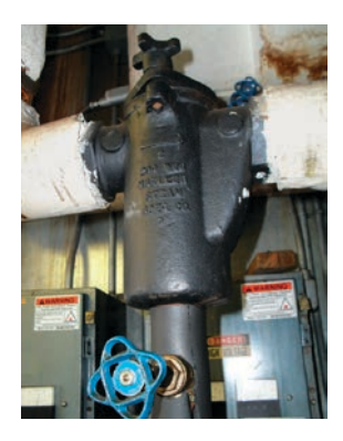
Inverted bucket steam traps are often used on larger air handling systems.

also reduces efficiency and, together with any "non-condensable" gases like nitrogen and carbon dioxide, needs to be removed. Steam traps are valves that discharge condensate and air from a steam system without loss of steam. This condensate can be returned to the boiler feedwater tank through condensate headers and pumps, and the air is vented to the atmosphere.