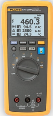
Fluke CNX 3000