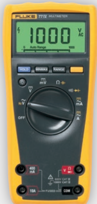
Fluke 77 IV