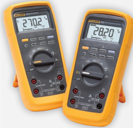
Fluke 28II / 27II