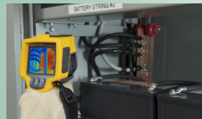
Checking the contact buss in the back of a battery bank cabinet (these lugs are tight). With a thermal imager, hands stay out of the cabinet.

Zeon Chemicals first used the Fluke Ti25 at six-month intervals. Since correcting findings that first year, that interval has been extended to once a year, and the results are remarkable.