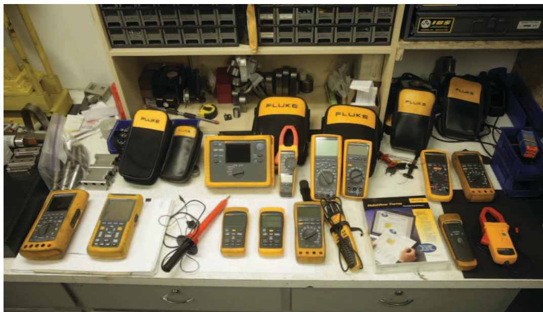
Everett Engineering uses a dozen different Fluke tools to cover their diverse testing workload.

One day, Paul got a call from a customer in Redondo Beach, California, complaining that a winch that Everett Engineering had built for one of its tugboats continually tripped offline. The customer naturally blamed the winch. Paul flew down to see the customer, monitoring and recording the winch in service over a 24-hour period with a Fluke 1735 Three-Phase Power Logger. Paul discovered the tripping was caused not by the winch itself but by a power quality problem. There were massive fluctuations in power, with spikes of up to 400 volts and distortions of 20 to 30 %. He used the tool to document his work and help the customer solve the root problem. This discovery gave Paul an idea. He began to monitor the power quality in his own plant. He was able to find and solve a low-lagging power issue affecting his machine shop.