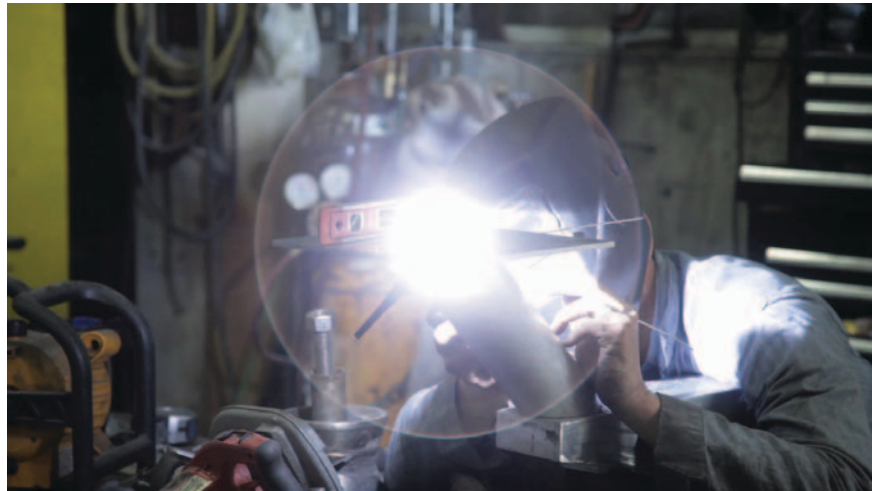
Dan Martin concentrates on a new machine design.

Applications: Monitoring and recording a winch, testing load cells and certifying the pulling capacity of tugboats, monitoring engine prop shafts, torsion testing on gearboxes