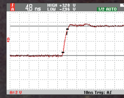
500 MHz with fast sample rate accurately capture and displays edges of pulse width modulated signals or harmonic content in fast clocks signals