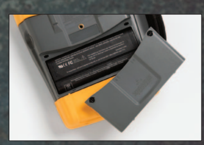
The 190 Series II delivers up to seven hours of battery life

20 years of Fluke ScopeMeter® test tool innovation