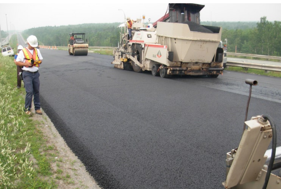
Taking asphalt temperatures during application.

"If asphalt is not applied at the right temperature it will cost much more in maintenance," Claude Boudrault of ITM explains. "Technically asphalt is supposed to last a certain number of years. However, if there are segregation problems from asphalt temperatures that are too hot or cold, then those years could be cut in half—and repairs are required much earlier in the cycle."