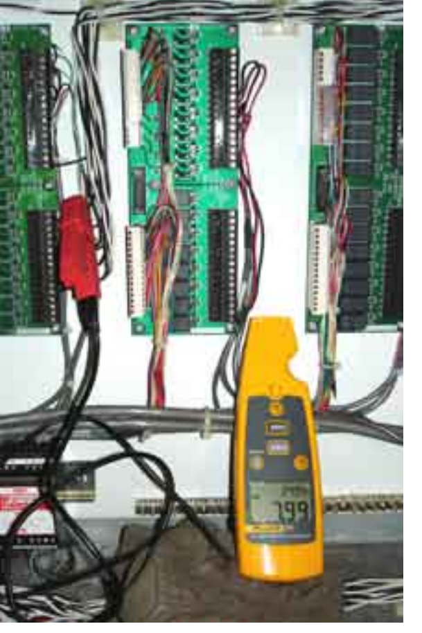
Figure 2: In specific applications, percentage readings on the Fluke 771 may be more useful than the underlying current readings – for example, when a control output must be maintained within a range of 25-30 % of the maximum level. Here, the Fluke 771 is connected to the emission control loop.

NOx. NOx is a precursor to a visible haze of pollution, which itself is a precursor to acid rain."