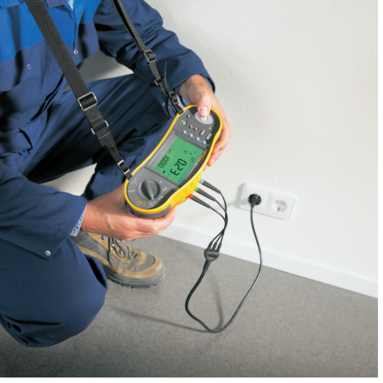
Electrician in Europe using the Fluke 1653 to test a receptacle.

Looking to take a 1650 Series instrument for a "test drive," Belcher acquired a 1653 model, the instrument in the series with the most features, including data storage for 500 measurements and the capability to download that data into a computer. Since acquiring the instrument, the master electrician has been reaping many benefits from its use on the job. He does caution, however, that there is a "learning curve" associated with using a 1650 Series instrument successfully.