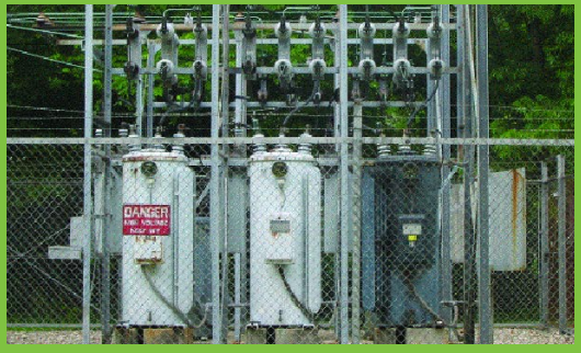
Examine transformers, comparing similar connections under similar loads.

A good thermographic approach to substation maintenance is to create inspection routes that include all the substations owned by your utility or facility. On a computer, save thermal images of each substation component and track temperature measurements over time. That way, you'll have baseline images with which to compare later images. Doing this will help you determine if temperature levels are unusual and, following corrective action, help you determine if maintenance was successful.