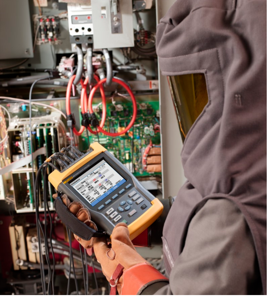
Periodically examine power quality for voltage sags, harmonics and other causes of overheating.

Overloading. If a load draws too much current, the system components upstream of the load have to carry that current. The main protection against overload is the overcurrent protection device which should open. If it does not open, the high current will cause overheating distributed along the portion of the system upstream of the excessive load.