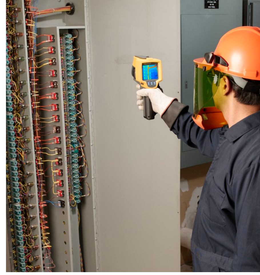
Use thermal imagers to check energized components for hot, loose or corroded connections.

Many of the tests aimed at preventing electrical fires also address reliability and safety,